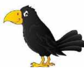
c - crow