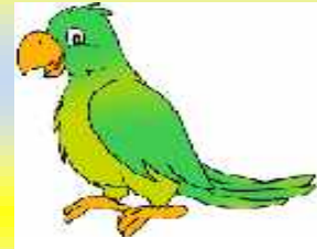
p - parrot