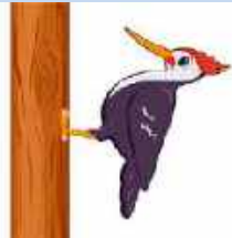
w - woodpecker