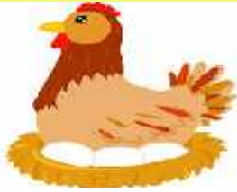
h - hen