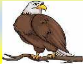
e - eagle