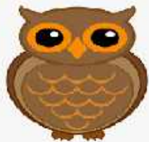
o - owl