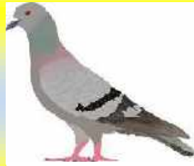
p - pigeon