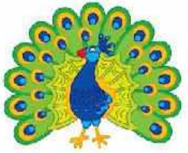
p - peacock