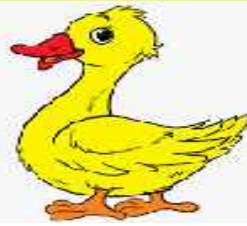
d - duck