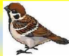
s - sparrow