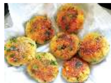
Healthy Food Options