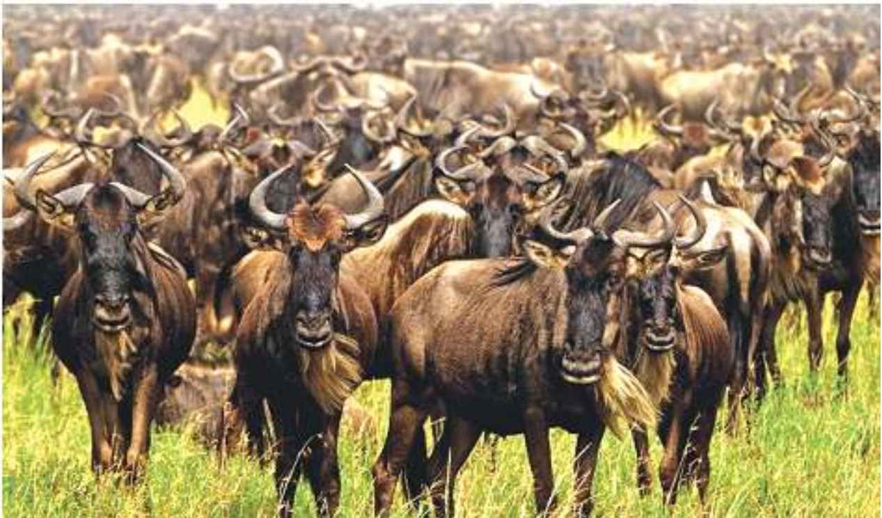
Migration of Wildebeests

Animals migrate with change in seasons. They migrate to find warmer weather, better food supply or safe place to give birth to their young. Animals do not follow a map or GPS. They know which direction to follow. They learn this from their parents and have a special sense! Caribou live in snow-covered areas. They migrate to warmer areas. Wildebeests of Africa migrate in search of green pastures, crossing many crocodile filled rivers. This great migration is known as one of the “Seven Wonders of the Natural World”.