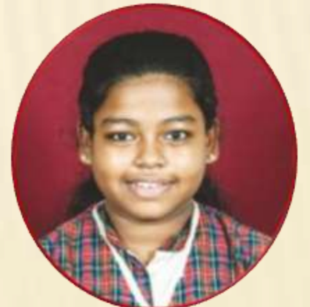
S SHAIRA 90%