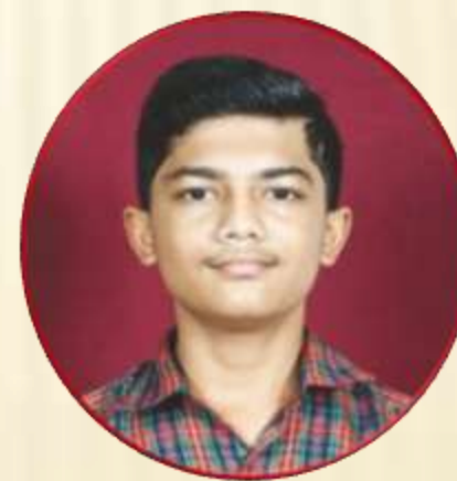
M TEJAS 96.6%