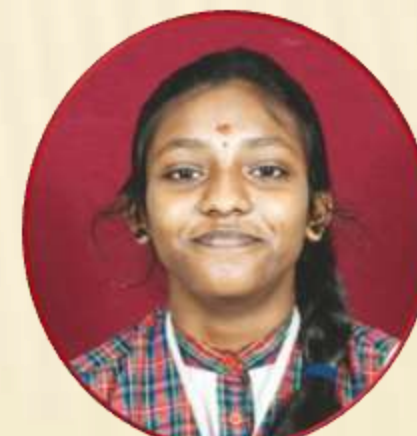
NETANYA R S 96.6%