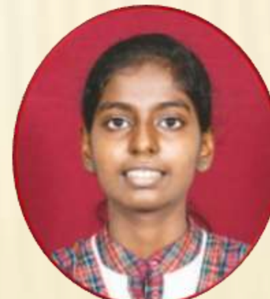
HASNA S 91.2%