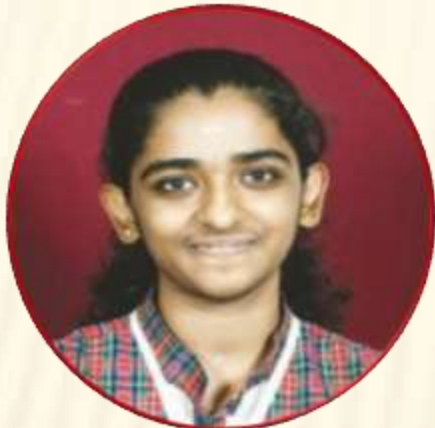
SNEHASRE S 90.4%