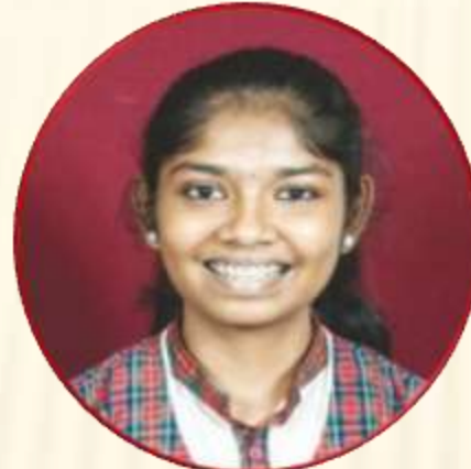
SHRI HARINI A 93.8%