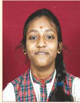
NETANYA R S 483/500 – 96.6%