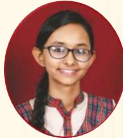
DWARITHAA B 90.8%