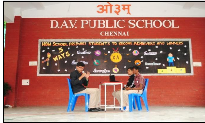
'KBC' – Quiz Time