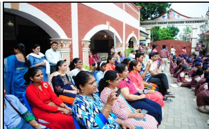
Proud Parents Witness the 'Fantastic Show'