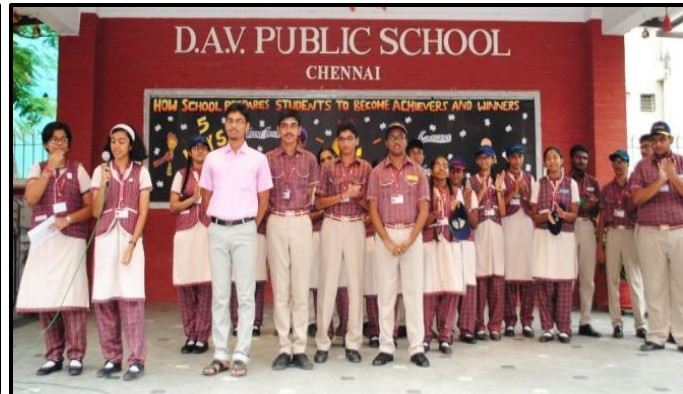
Triumphant Winners and Achievers of 2018-19