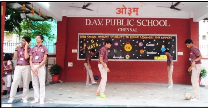
'Sport – O- Mania' – Football Freestylers