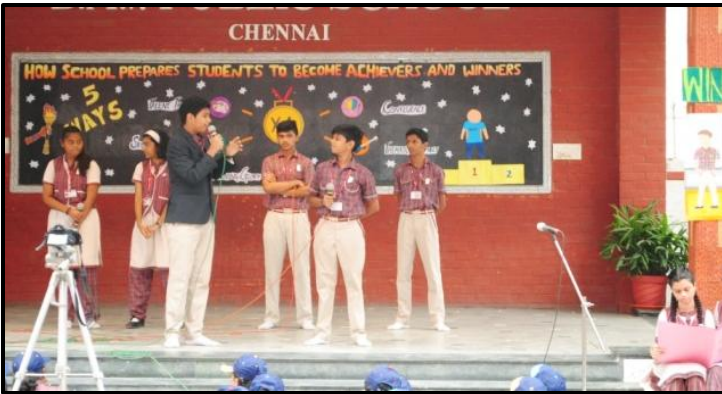
'Boss Confluence' – A Talk Show