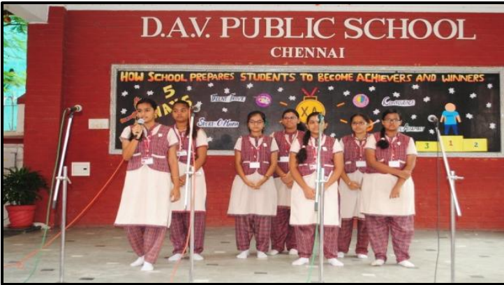
Thematic Assembly - 'Musical Extravaganza'