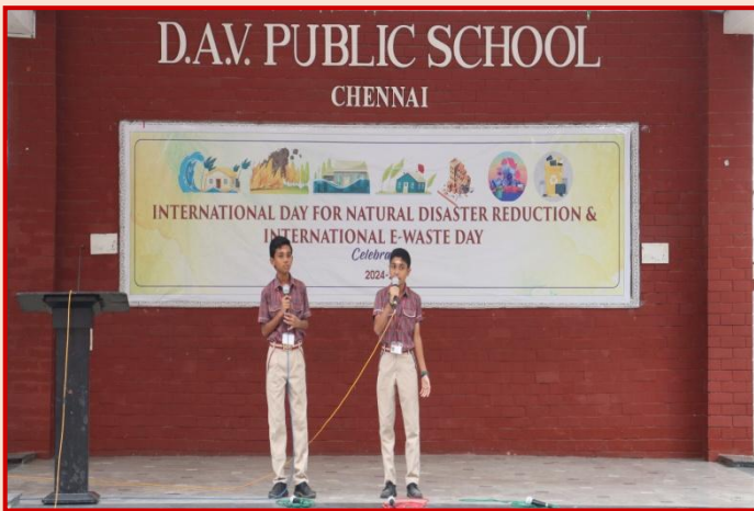
Our Energetic Young Hosts Leading the Show with Flair