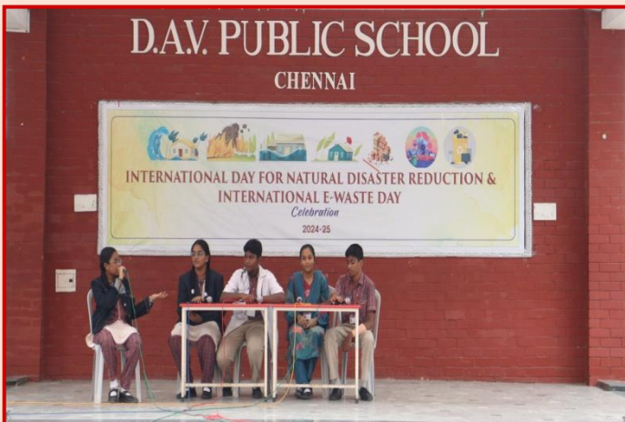
Wayanad Landslides: Unraveling the Causes and Exploring the Aftermath