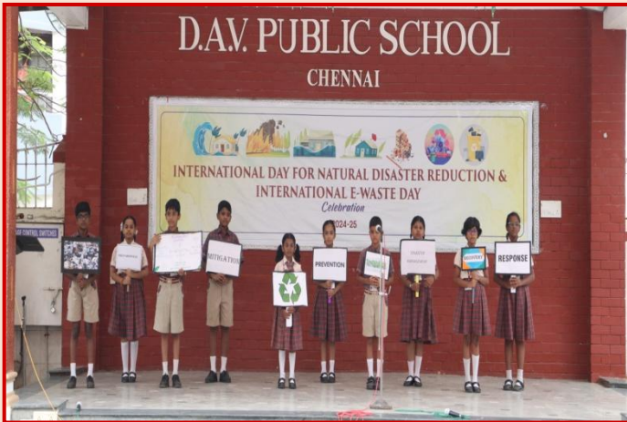
Key Insights into Transformative E-Waste Management Solutions