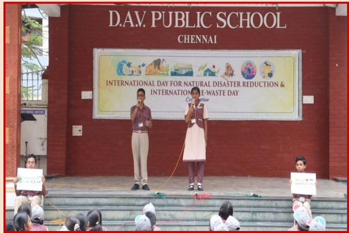
Emerging Authors Highlighting the Importance of This Day