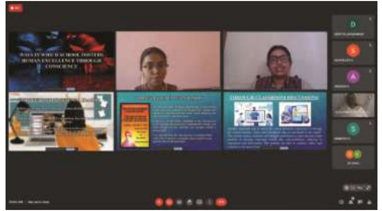
A Presentation on the various initiatives taken by the School to instil Conscience among students