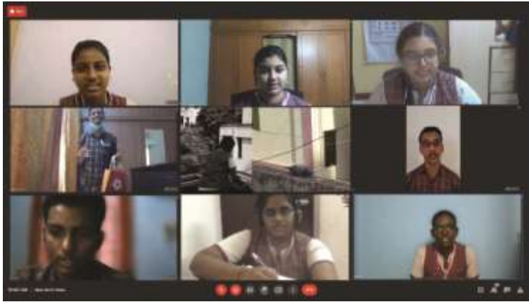
A Skit on How School fosters Human Excellence through Conscience during the Pandemic.