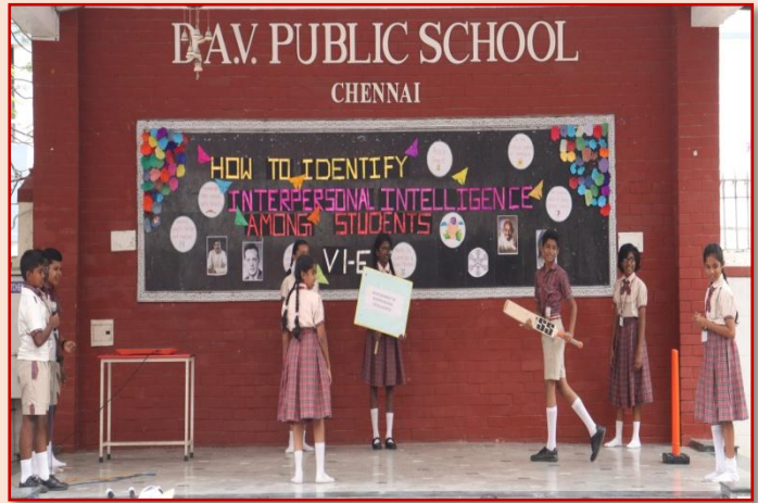
Displaying Interpersonal Skills – A Scene at the Cricket Field