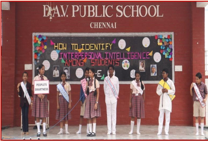
Interpersonal Intelligence in Various Professions