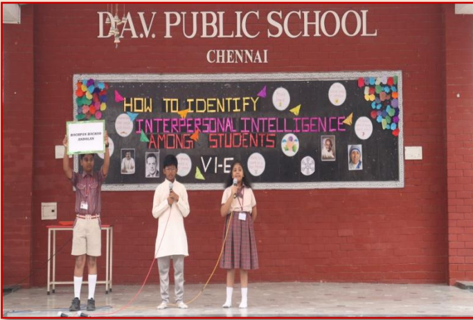
Coffee with a Celebrity – Kailash Satyarthi