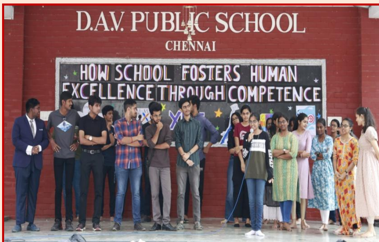
Insights by the Alumni on Competence