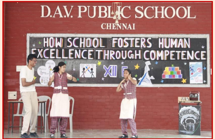
Chai Champion, Take a 'Short Commercial Break'!