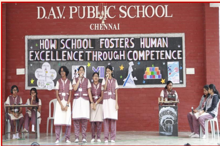
A Display of Musical Intelligence