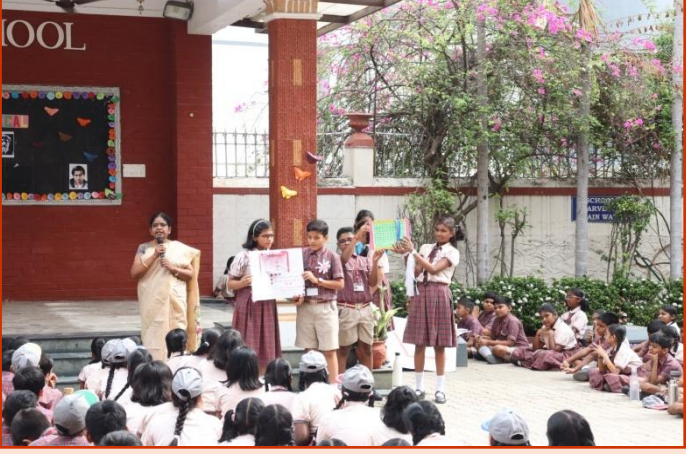
Words of Appreciation from our Beloved Principal Ma'am

Graceful Grooves – Energetic Western Dance Performance