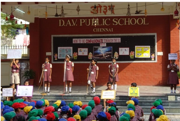
We must develop our Empathy