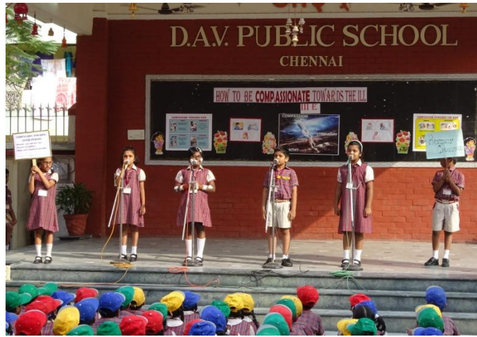
Compassion towards leper person