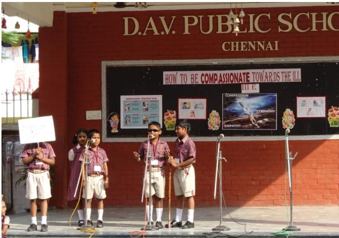
Compassion towards physically challenged – Be Caring