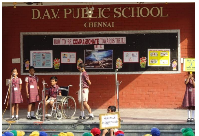
Compassion towards physically challenged - Understanding