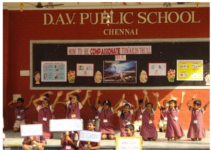
We can, we do, we know